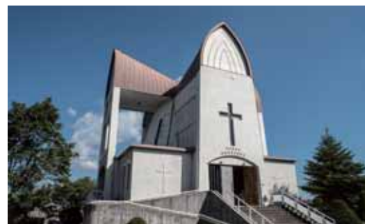
Hakodate St. John's Church