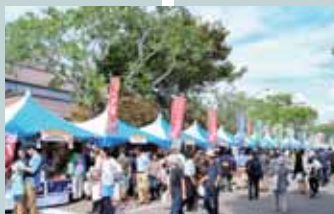
[Hakodate Gourmet Circus] [Early to mid September]