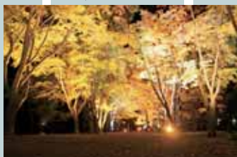
[Hakodate MOMI-G Festival (autumn leaves festival)] [Mid October to early November]