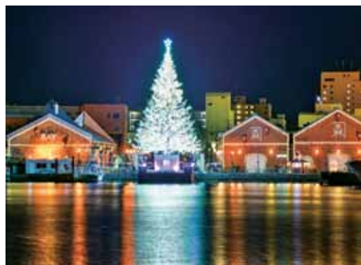
Tree Floating in the Sea ③