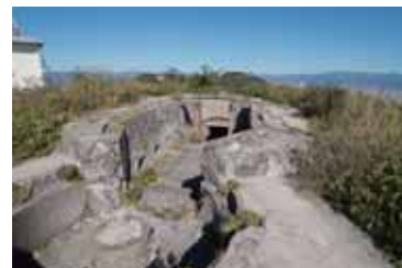
Remains of Mt. Hakodate Gun Battery ③ (old fortification)

“立待岬, Tachimachimisaki” the name of place is composed of 3 Japanese letters. The first one, “立, Tachi”, means standing. The second one, “待, machi”, means ambushing. The last one, “岬, misaki”, means a cape. Once Ainu, indigenous people of Hokkaido, stood and ambushed fish to catch on this cape. So please visit there to see the beautiful sight!