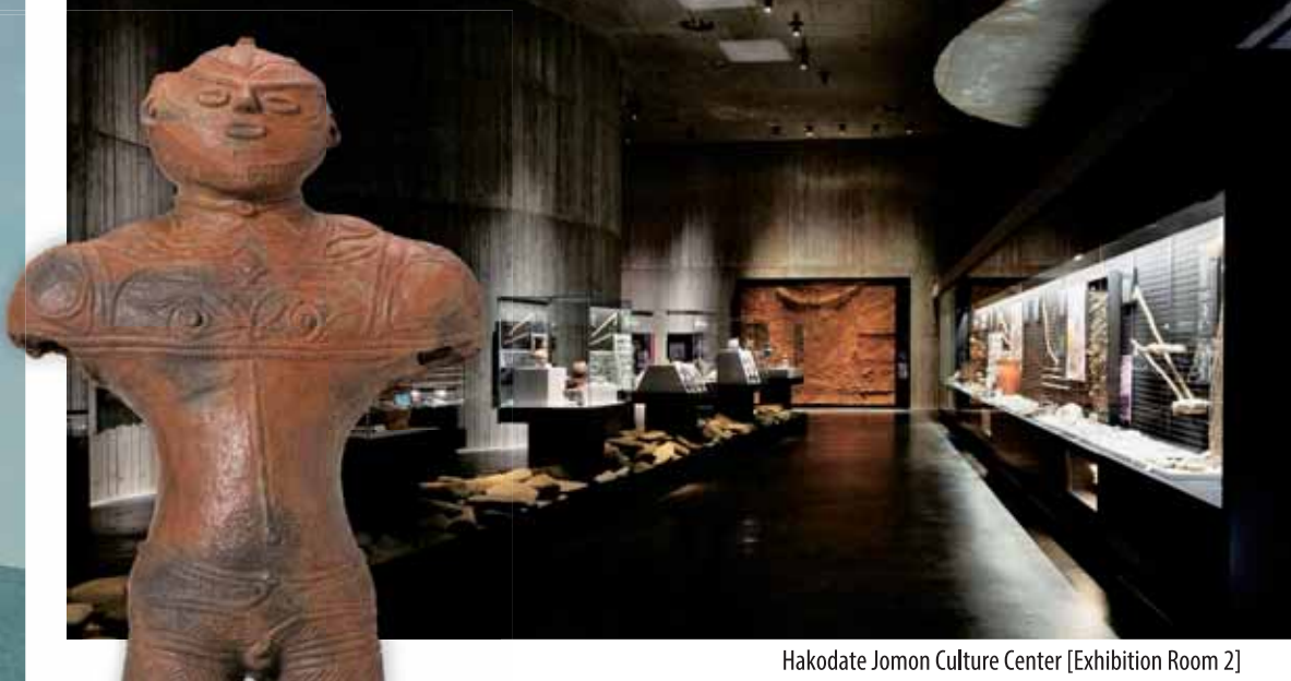
Hakodate Jomon Culture Center [Exhibition Room 2]

Hakodate has much more to offer than its city-based attractions. Get off the beaten path and take a road trip along Route 278.