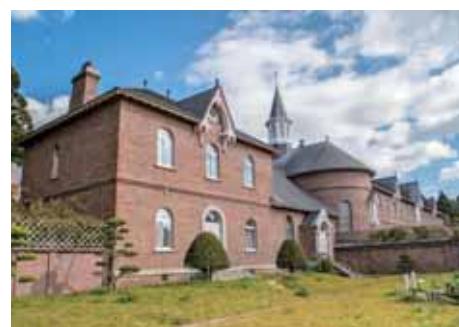
Trappistine Convent ④

Yunokawa Hot Spring Resort is one of the pre-eminent hot spring areas in Hokkaido. Nearby is Japan’s first Christian convent, the Trappistine Convent, established in 1898. You’ll also find Yukura Shrine, a Shinto shrine with over 300 years of history. Yunokawa is richly endowed with historic locations of a strikingly different character than those of Hakodate’s west side.