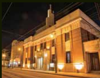
Hakodate City Museum of Literature