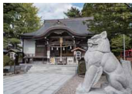
Yukura Shrine ③

At Hakodate Tropical Botanical Garden, from December to early May you can watch Japanese monkeys soaking contentedly in the hot springs. It is heart-warming to see the monkeys soak in the hot springs to withstand the cold and blowing snow of winter, just as humans do.