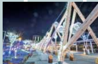
[Hakodate Station Square Illumination] [December to February]