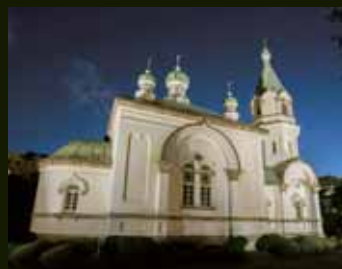
Hakodate Orthodox Church