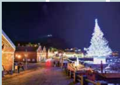
[Hakodate Christmas Fantasy] [from 1 to 25 on December]