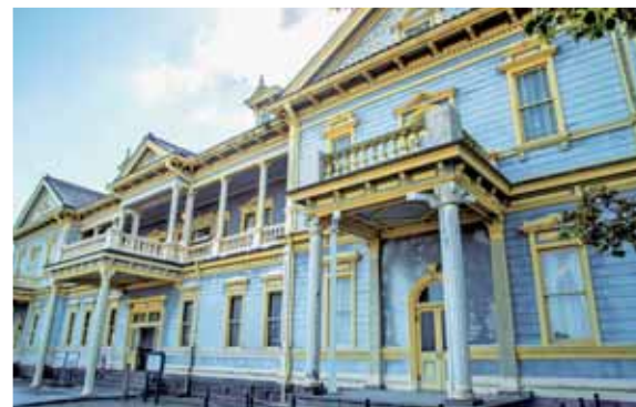
Old Public Hall of Hakodate Ward