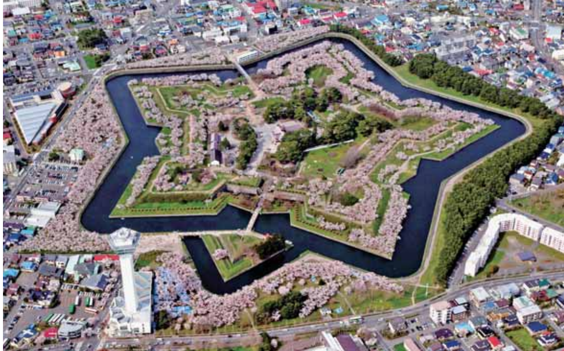
Goryokaku Park, Goryokaku Tower ①