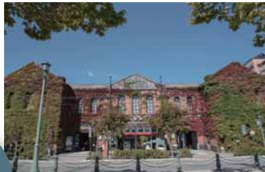
Hakodate-Meijikan (Old Hakodate Post Office) ⑤

One of the pleasures of visiting Hakodate in the winter is an enormous tree that appears over the water in front of the Kanamori warehouse district during the Christmas season. The tree is a gift from Hakodate's sister city, the Canadian city of Halifax, Nova Scotia, and every year it brightens Hakodate's winter evenings.