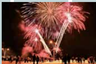
[Hakodate offshore winter fireworks display] [Early or mid February]