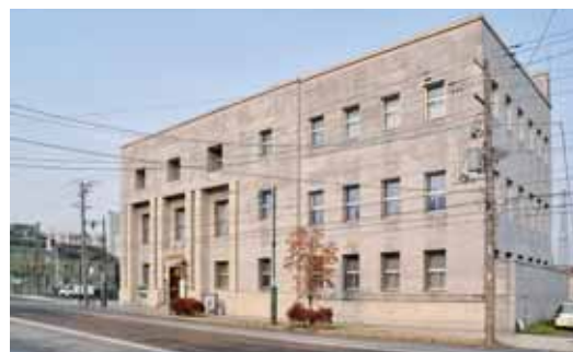
Museum of Northern Peoples ④