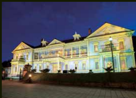
Old Public Hall of Hakodate Ward