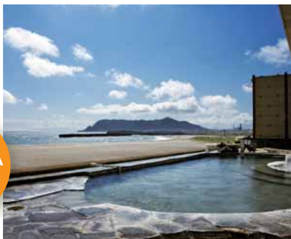
Yunokawa Hot Spring Resort ②