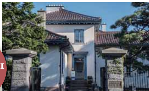
Former British Consulate of Hakodate (Opening-Port Memorial Hall)