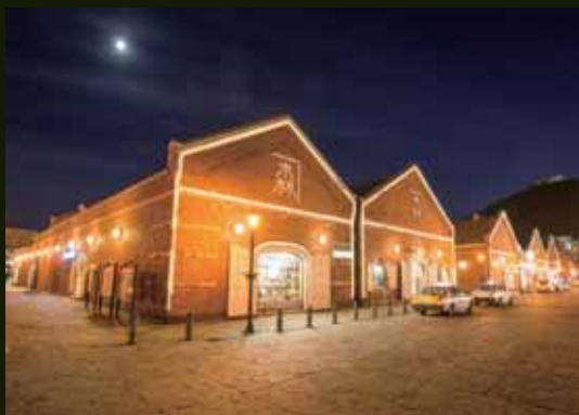
Kanemori Red Brick Warehouse

The night sky from this vantage point has been described as “like the moment when you open a jewel box.” This dazzling spectacle unfolds below you.