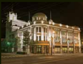
Hakodate Community Design Center

(Old Suehirocho branch office of Hakodate municipal government)