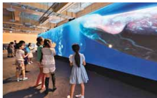
Future Center Hakodate ②