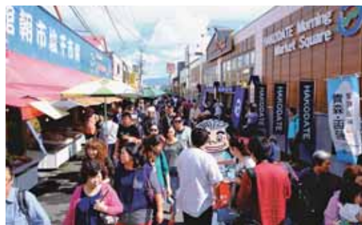
Morning Market ①