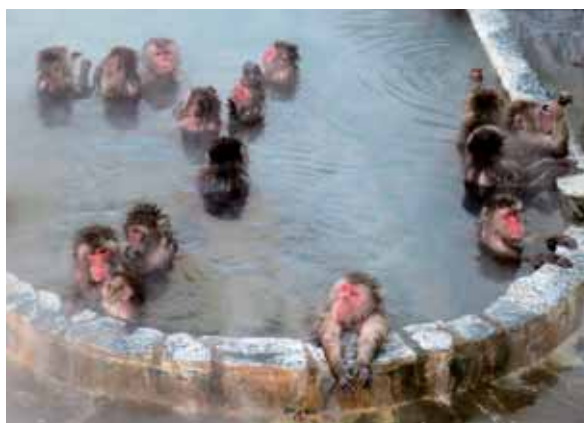
Tropical Botanical Garden ①