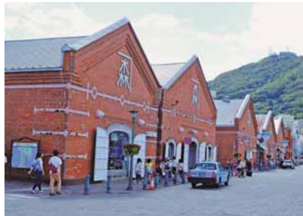
Kanamori Red Brick Warehouse ⑥

The Hakodate Morning Market, red-brick warehouses lining the Port of Hakodate and other attractions make the Bay Area a vibrant district full of things to see and great food to eat. If you come for the shopping and gourmet experiences, you'll stay for a stroll around the many historic buildings dating to the 19th and early 20th centuries. Serene in the morning, dramatically illuminated at night, the ever-changing face of the Bay Area offers scenery that is not to be missed.