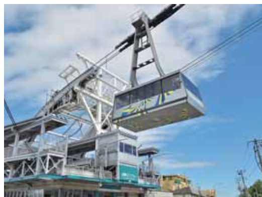
Mt. Hakodate Ropeway