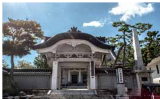
Higashihongan-ji Temple Hakodate Branch (Otani sect of Shinshu Buddhism)