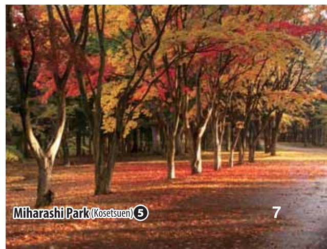
Miharashi Park (Kosetsuen) ⑤