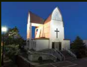
Hakodate St. John's Church