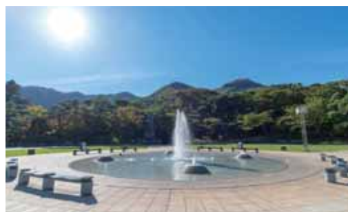
Hakodate Park ⑤

Why not walk to the top of Mt. Hakodate? There are a number of clearly marked trails which are popular all year round. Enjoy the peace and quiet and perhaps do some birdwatching on the way. It takes about an hour to reach the top.