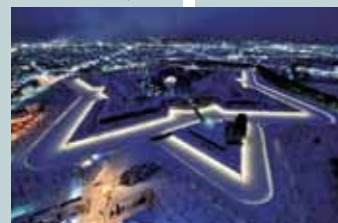
[The star illumination of Goryokaku] [December to February]