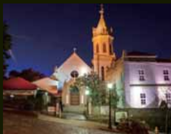
Motomachi Roman Catholic Church