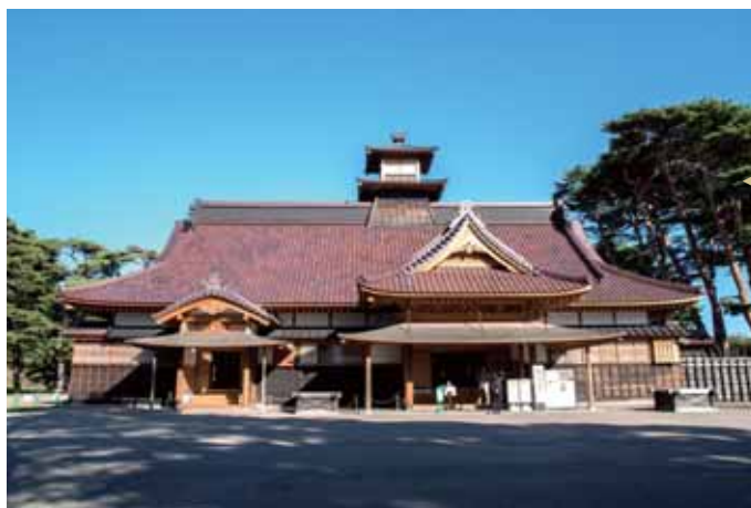
Hakodate Magistrate's Office ②

This facility has been used as government office reception for foreign countries during the mid-19th century.