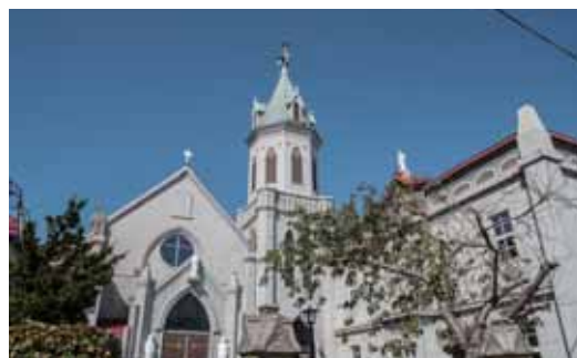
Motomachi Roman Catholic Church