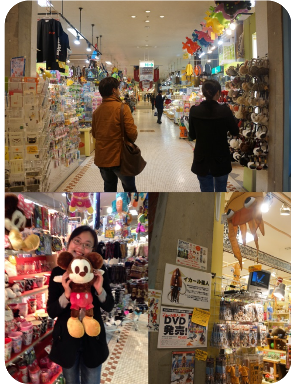
A variety of shops in Akarenga

Akarenga also has cake shops, so if you get hungry, you don't need to go far at all. It really is convenient!