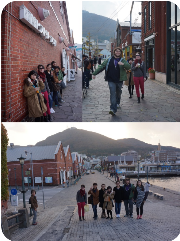
Views of the Kanemori Red Brick Warehouses in the Hakodate Bay Area

After the cruise was over and we disembarked, we headed to "Akarenga". Since it was only across the road, it was really convenient! "Akarenga" is a shopping mall that is inside some beautiful old renovated warehouses on the harbourside. Basically, it's a shopping paradise where you can buy many weird and wonderful things. You can even buy souvenirs!