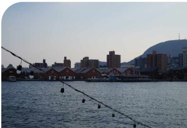
Enjoying the cruise on the boat

We went on the cruise in the afternoon, and were amazed at how different and attractive the city of Hakodate looks from the sea. The cruise runs every 30 minutes on the hour and half hour, so you can choose when you want to go. If you go during the daytime, you can see the full view of the city in all its beauty, as well as coming close to Hakodate's seagulls and even dolphins if you're lucky. However, if you want to experience a romantic atmosphere, it's best to go during the sunset or to see the city lights at night-time.