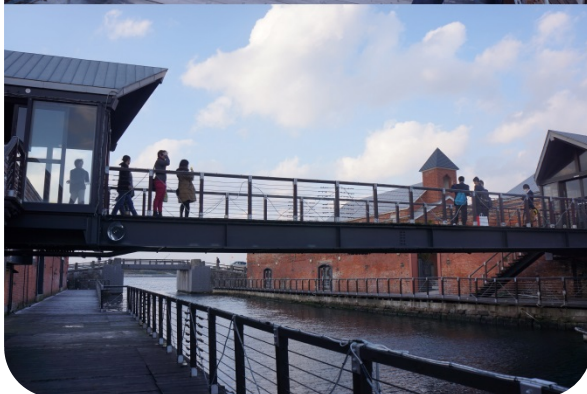
Checking out the view from the bridge