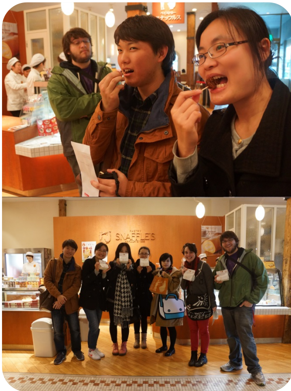
The cheesecake shop, Snaffles! Those cakes are really good...

Naturally, delicious food is almost a way of life here, so there is plenty to be found in Akarenga. In particular, we want to introduce Hakodate's famous and very popular cheesecake. "Snaffles" is a shop that specializes in 'Western Style' cheesecakes, which are extremely popular in Hakodate.