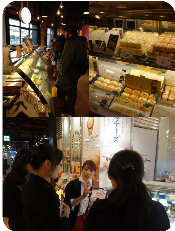
Buying Petit Merveille Cheesecakes!

If we were to compare them, Snaffles is ideal for children, whereas those with an adult taste might prefer Petit Merveille. Either way, they are both delicious and should definitely be eaten! There's no such thing as too much cheesecake!