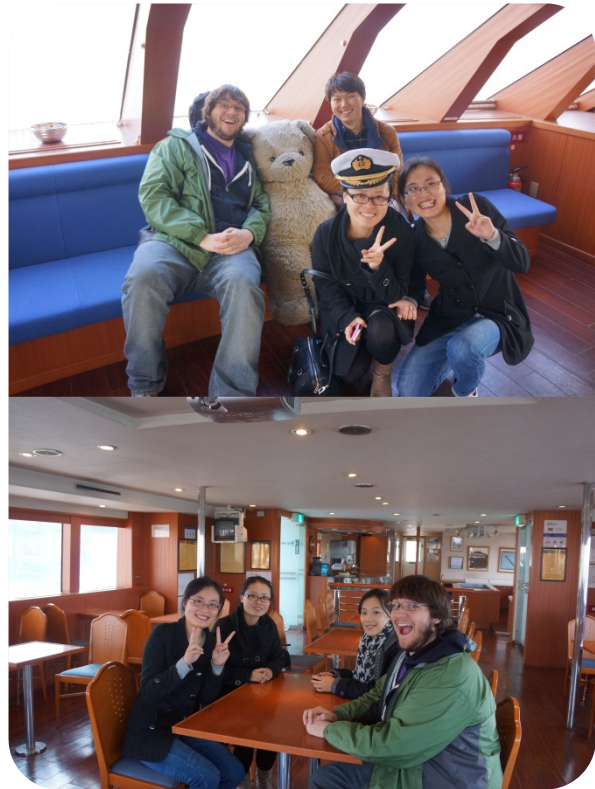
Inside the ship, at the café. Isn't the teddy bear cute?

On the second level, it's an open deck, so you can feel the sea breeze and enjoy the view of Hakodate directly. Don't worry if you get tired while up on deck either, because there are convenient benches to use there as well!